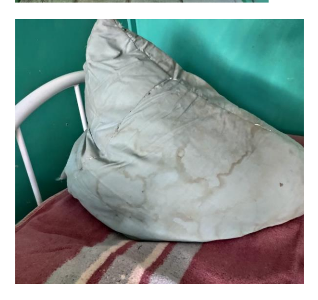
Therapeutic department of the hospital in Bilolutsk, Novopskovskyi district, May 2020.